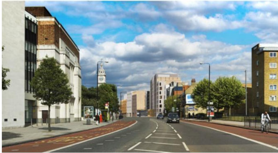
View of Approved development looking east along Mile End Road