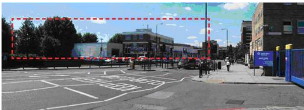
Former buildings now demolished. Application site marked by broken line

4.14. In total, there was previously approximately 2,700 sq. m of accommodation across the site split between the car showroom use (2,429 sq. m) and the bar/nightclub (240 sq. m).