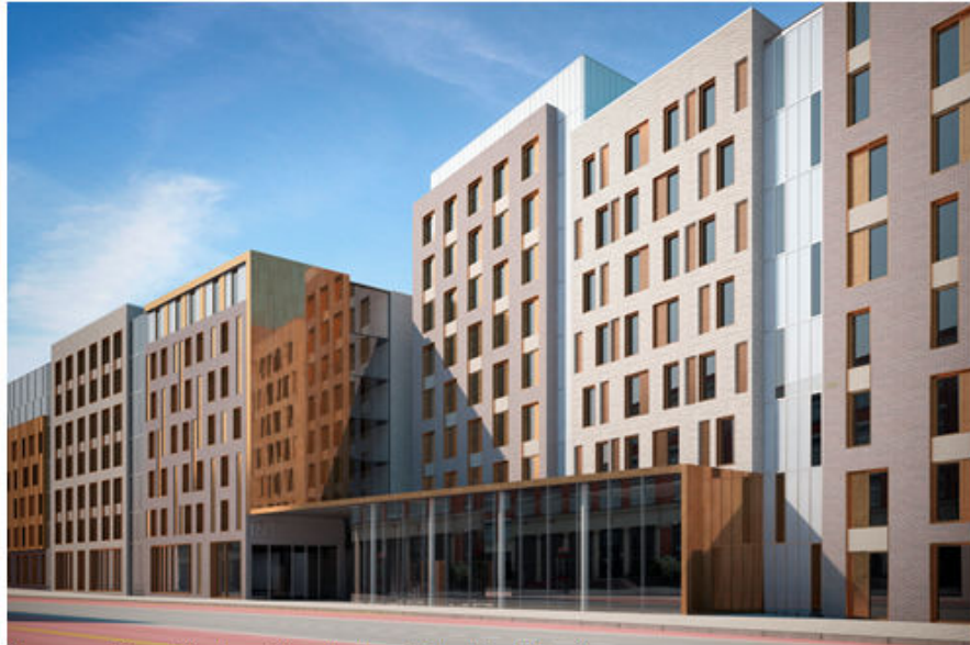
Approved north elevation facing Mile End Road